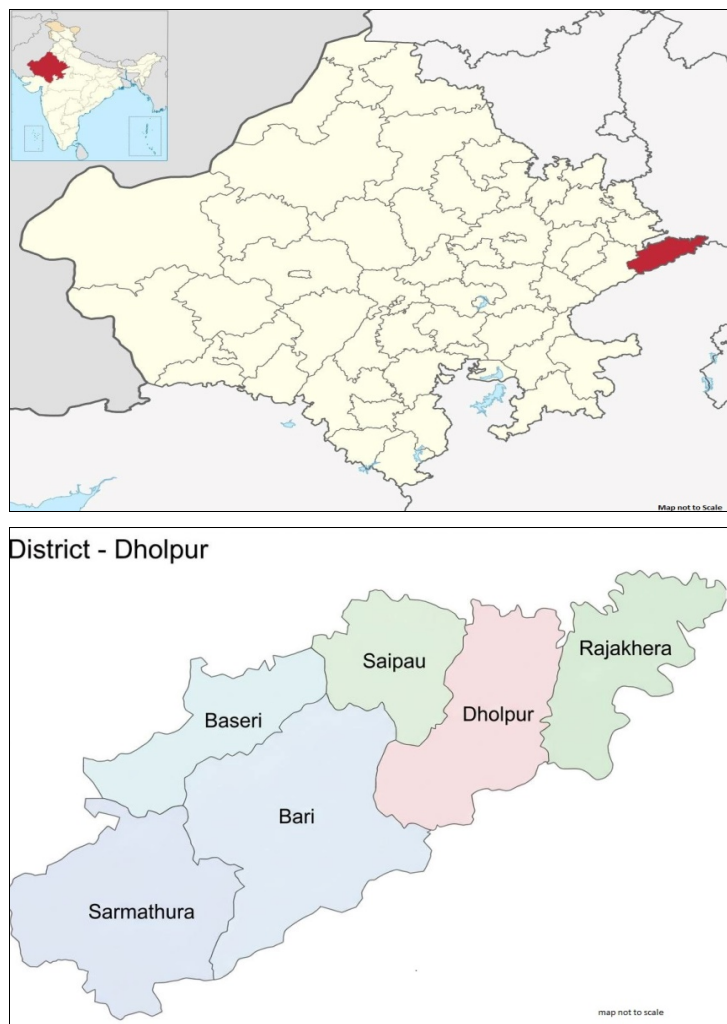
Fig 1: Study Area Map

Geographically, the district holds a strategic position as it shares its boundaries with Madhya Pradesh and Uttar Pradesh, and lies close to major tourist centers such as Agra and Gwalior. This advantageous location provides Dholpur with an opportunity to be integrated into the broader tourism circuit of northern India. The district is often referred to as the “Land of Red Stone” due to its rich deposits of red sandstone, which have been used in the construction of several iconic monuments in India, including the Red Fort in Delhi. The historical evolution of Dholpur dated back to ancient times, with evidence suggesting its association with early civilizations and various ruling dynasties, including the Mauryas, Rajputs, and Mughals. These historical influences have contributed to the development of a rich cultural and architectural heritage in the region (Rajasthan Tourism, 2026).