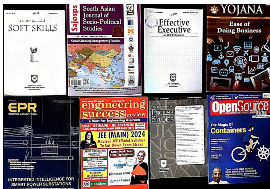
Fig 2: Example of Journal and Magazines for Career Corner

Before choosing journal, magazine and others periodicals look or strain on the subject or focus on the career guidance which are plays the very crucial points. Because in the technical college library users requirement are varieties like course up-gradation, software development, core engineering development, competitive examination, project corner etc. So, keep in the mind below types of pictures represent or focus career development documents (figure – 2).