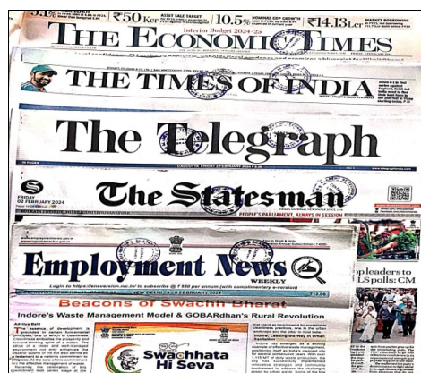
Fig 3: Example of Newspaper for Career Corner

Daily newspapers are plays a very vital role for career counseling, it gives not only point to job related, it published article play very crucial role for guidance of the students. There are so many newspapers available in the market and their presentation style are different however their motive or target more or less same for its targets audience. Here given some example of newspapers pictures (figure – 3).