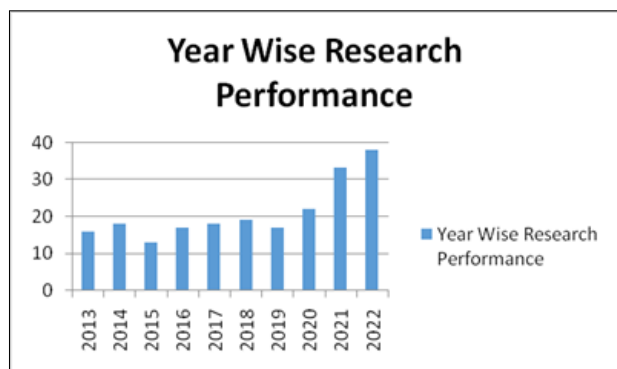
Fig 7.3: Yearwise Research Performance

According to Table 7.3, there are a total of 210 publications. In terms of the number of publications, 2022 was the most fruitful year for research. In 2022, 38 research papers were published in various channels. 2015 was the least effective year for research, with only 13 publications. It demonstrates that librarian productivity rises year after year. It has grown quicker than the previous year.